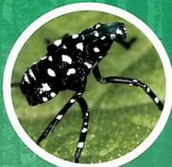
Early nymph April-July