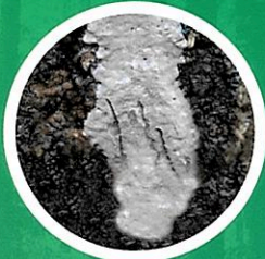
Egg mass Sept.-June