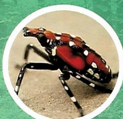
Late nymph July-Sept.